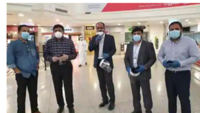
NRI businessman charters flight to evacuate employees from UAE to Kerala