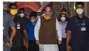
'Bury differences, unite and work to fight Covid-19 in Delhi': Amit Shah tells political parties