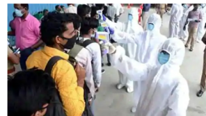
'Maximised restricted lockdown' in Chennai, 3 other districts from June 19