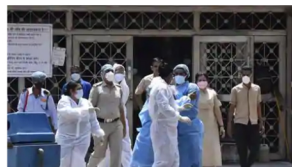
Amid surge in Covid-19 cases in India, recoveries rise to 51%