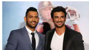
'MS Dhoni very morose having heard of Sushant Singh Rajput's passing'