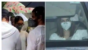
Sushant Singh Rajput's last rites performed, colleagues pay tributes