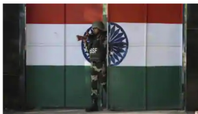
2 high commission officials missing in Pak to be released, India told after strong demarche