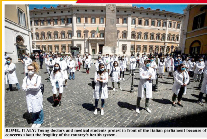
ROME, ITALY: Young doctors and medical students protest in front of the Italian parliament because of concerns about the fragility of the country's health system.